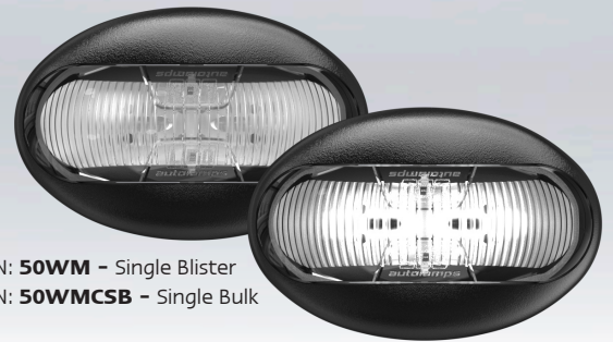
P/N: 50WM - Single Blister P/N: 50WMCSB - Single Bulk