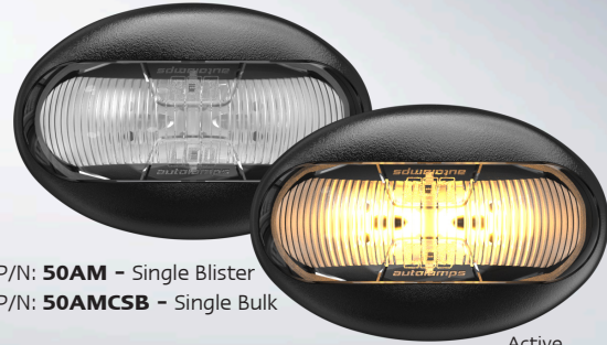
P/N: 50AM - Single Blister P/N: 50AMCSB - Single Bulk