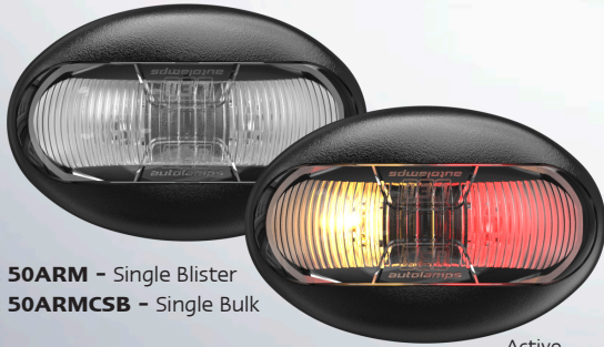
P/N: 50ARM - Single Blister P/N: 50ARMCSB - Single Bulk